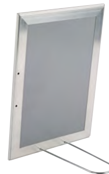
UYUP057000 Counter support available. Suitable for both landscape&portrait.